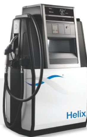
Helix™ 2000 Fuel Dispenser

Available in Latin America, Europe, Middle East, Africa and Asia Pacific.