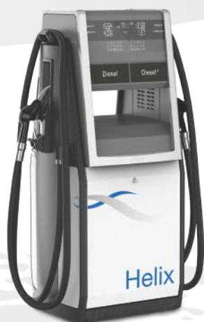
Helix™ 1000 Fuel Dispenser

Meet the family. One global dispenser platform. Five models to address your needs. The Wayne Helix dispenser family is highly configurable, addressing the specific needs of users no matter their fueling demands.